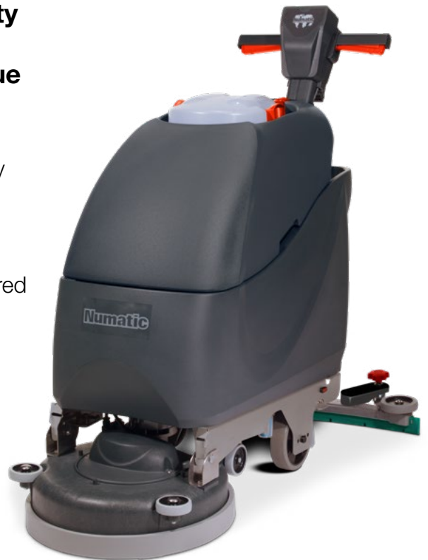
Replacement Blade Set