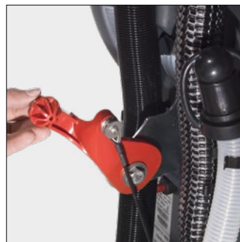
Floor Tool Lifting Handle