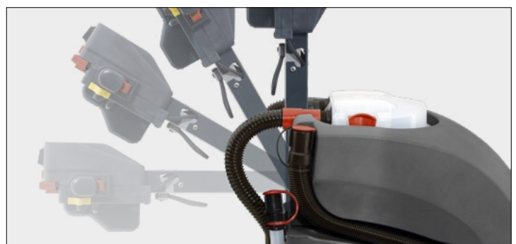
Fully Adjustable Handle