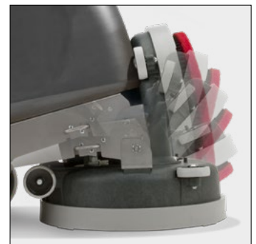
Tilting Brush Deck