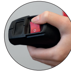
Integrated hand control