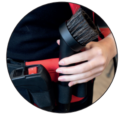
Waistbelt tool storage