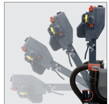
Fully Adjustable Handle