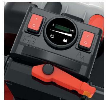
Simple Operator Controls