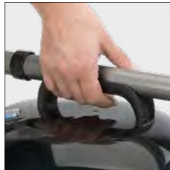
Convenient Carry Handle