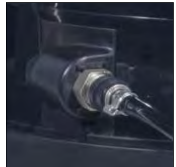
Quick Release Cleaning Liquid Connector